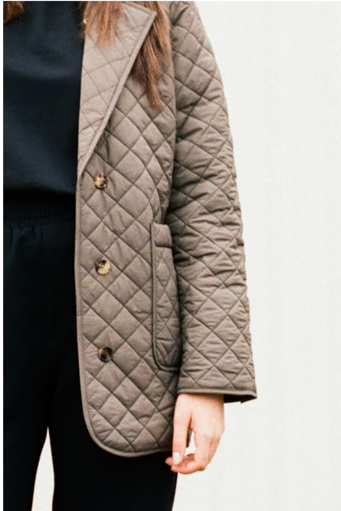
ABOVE & OPPOSITE SIDEE CAMITTA - PADDED TECH - MOSS GREEN