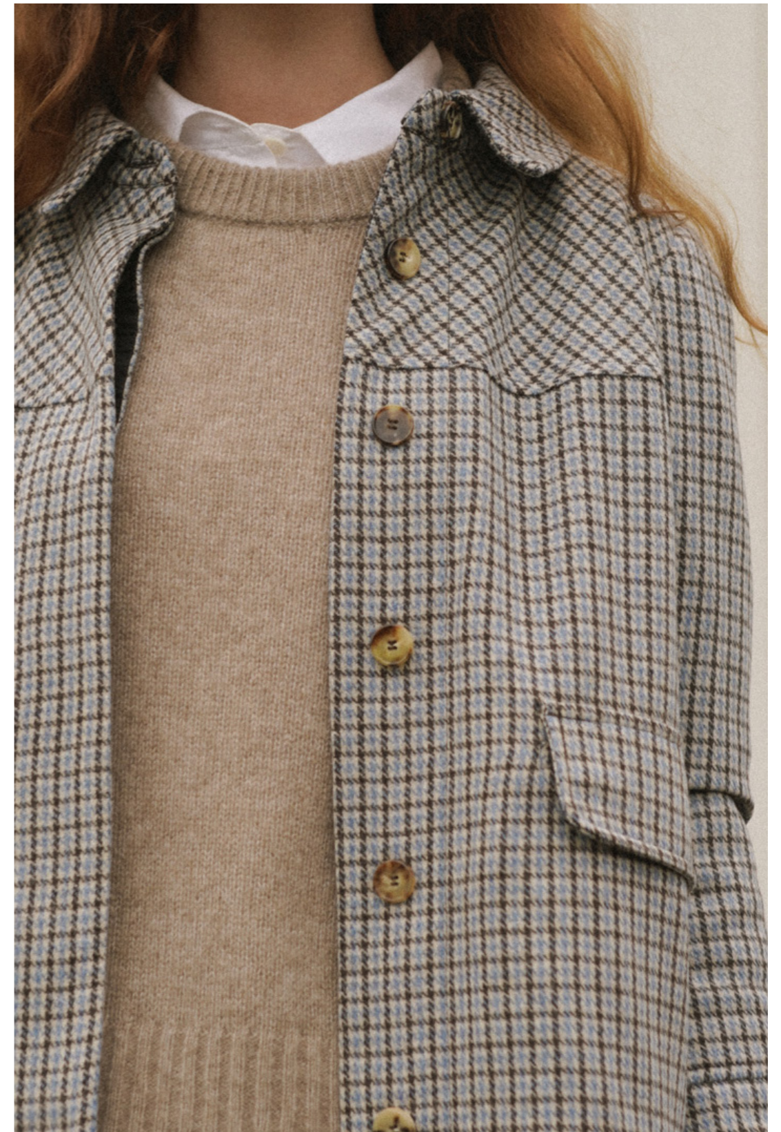
ABOVE COETTA JACKET - CHECKERED WOOL - BLUE/GREY KATH - CASHMERE SILK KNIT - NOUGAT