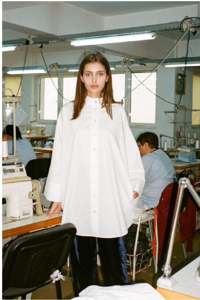
ABOVE & OPPOSITE SIDE SASCHA - MAYFAIR SOLID - WHITE PEARL - SILK VELVET - NAVY