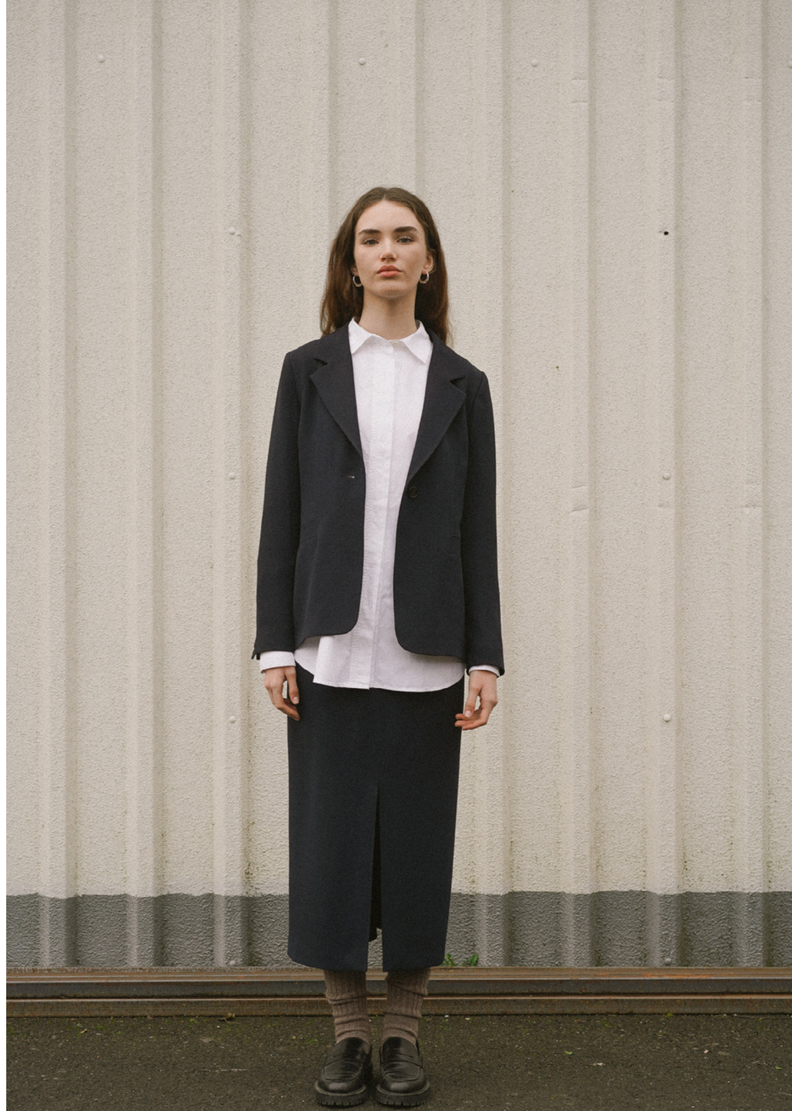
SHELBY SHIRT - GMTD POPLIN - WHITE CICI - HEAVY CREPE - NAVY PIXIE - HEAVY CREPE - NAVY