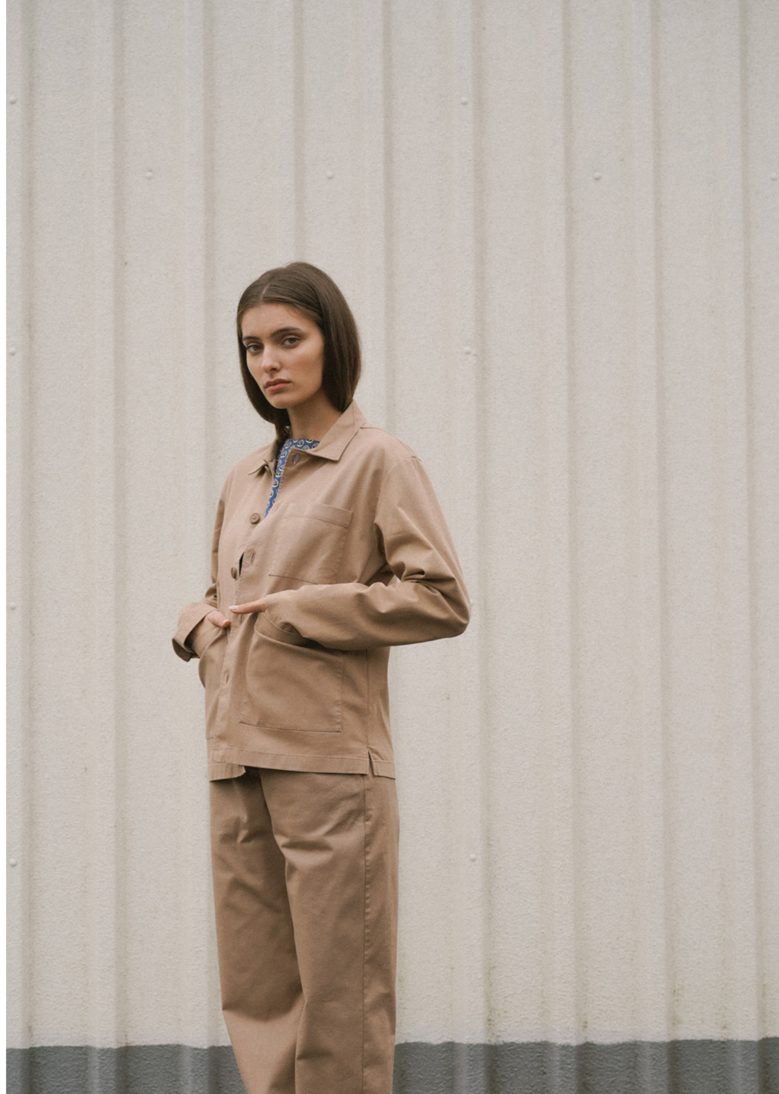
CAMERON JACKET - GMTD TWILL - LIGHT BROWN PALLA PANTS - GMTD TWILL - LIGHT BROWN SIMONE SHIRT - JAPANESE FLOWER PRINT