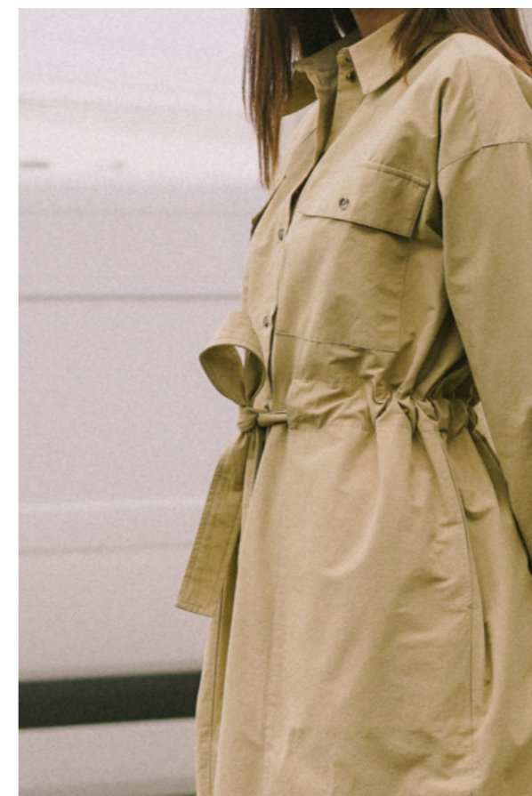
ABOVE & OPPOSITE SIDE DARCY DRESS - COTTON TECH - SAND PALLA PANTS - GMTD TWILL - NAVY