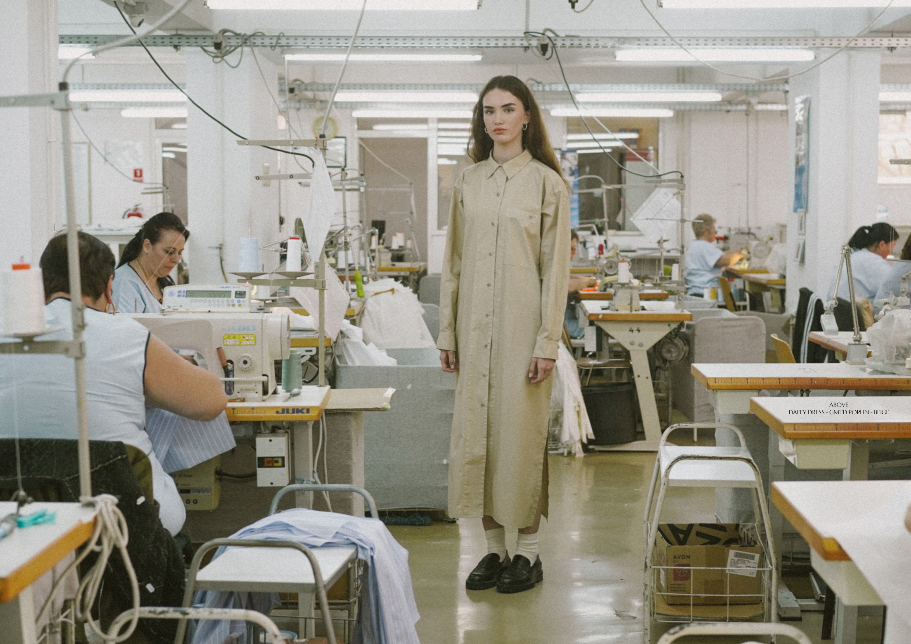
ABOVE DAFFY DRESS - GMTD POPLIN - BEIGE