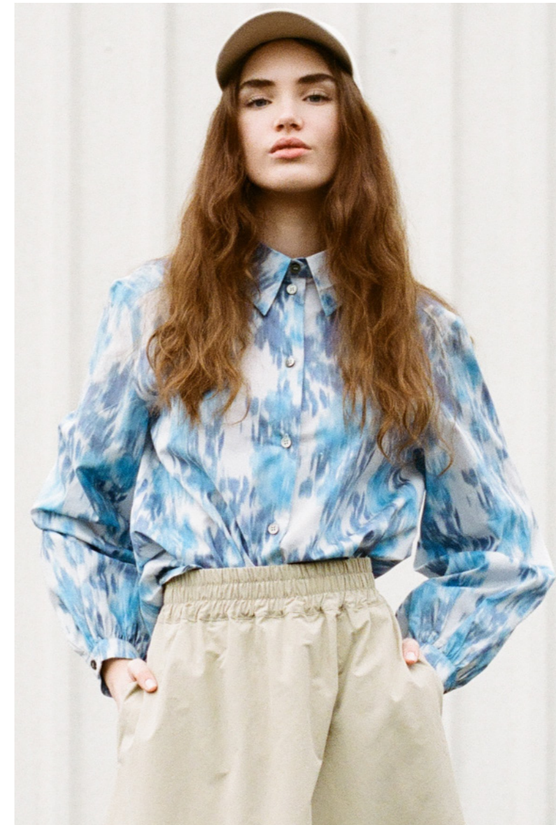
ABOVE & OPPOSITE SIDE SIKITA SHIRT - JAPANESE ABSTRACT PRINT PISCES SKIRT - COTTON TECH - SAND