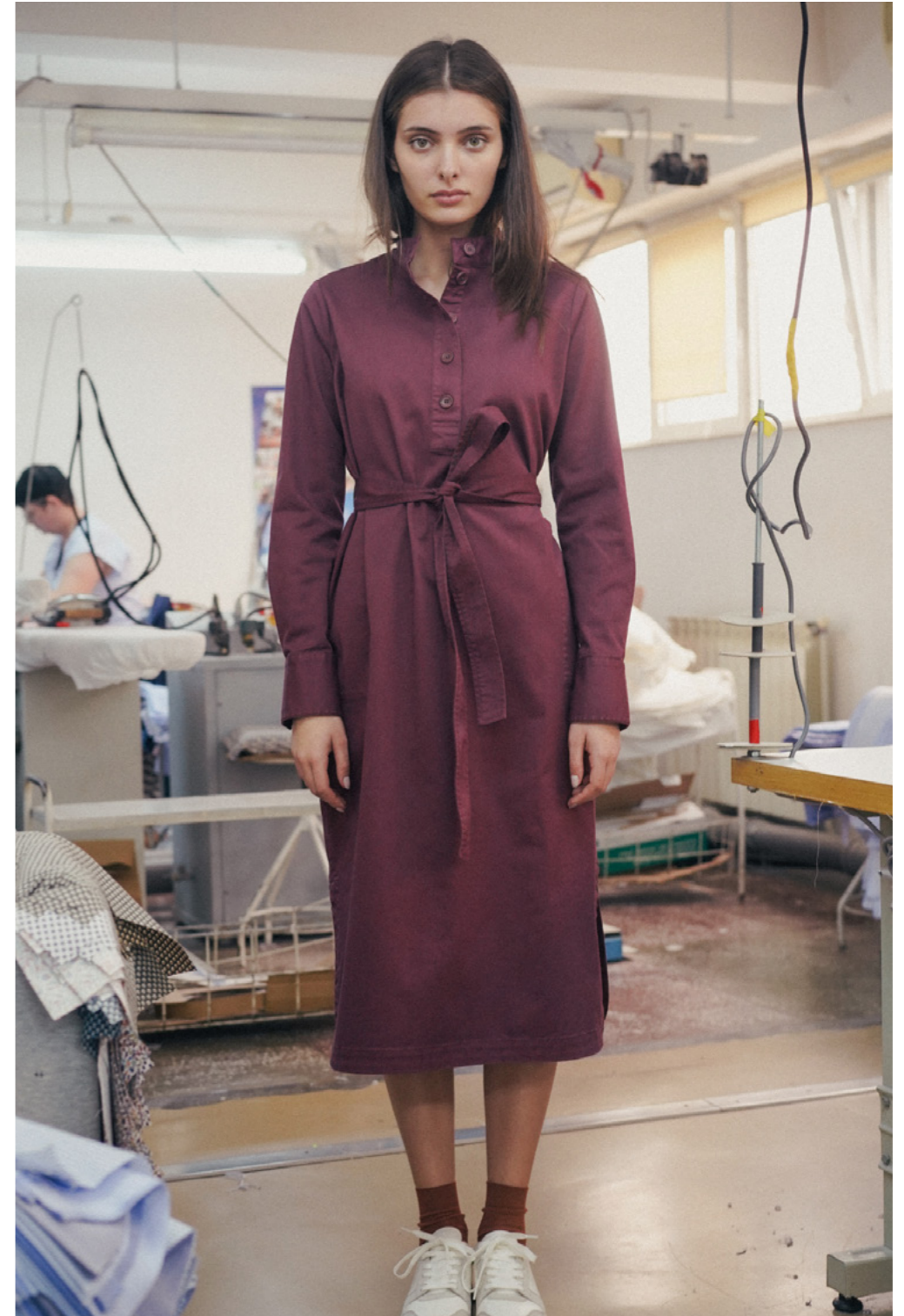
ABOVE & OPPOSITE SIDE DILLON DRESS - GMTD TWILL - RED MAHOGANY SABINE SHIRT - GMTD POPLIN - DESERT ROSE