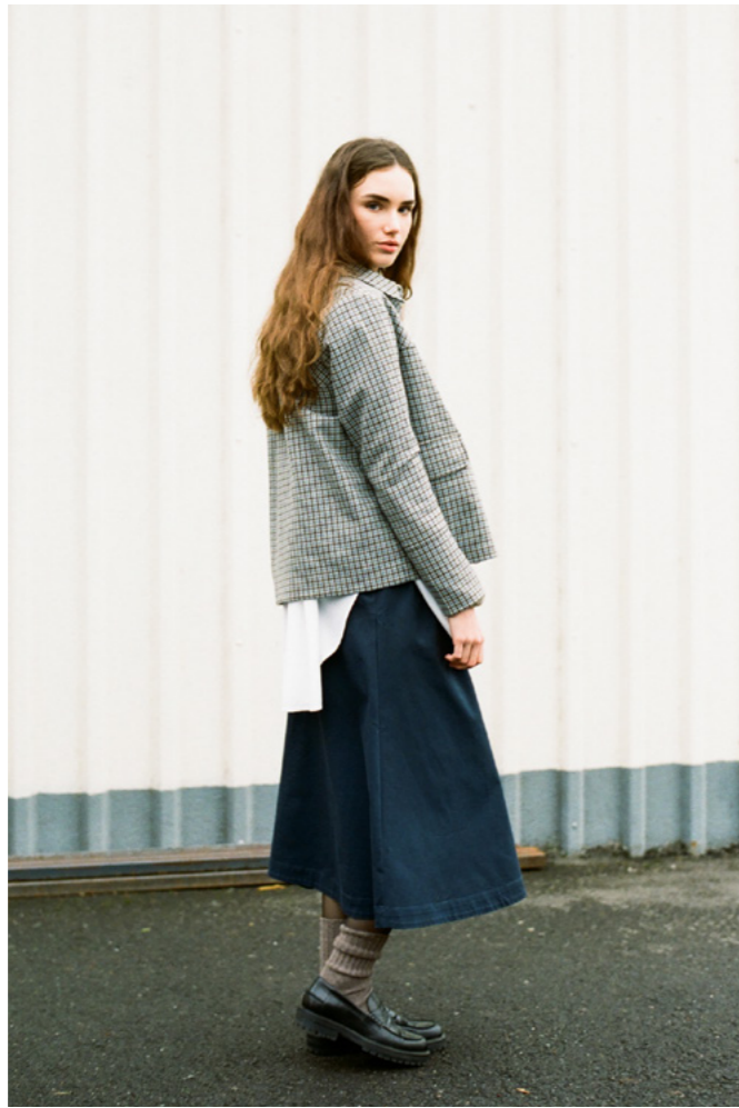
ABOVE & OPPOSITE SIDE COETTA JACKET - CHECKERED WOOL - BLUE/GREY PEN SKIRT - GMTD TWILL - NAVY