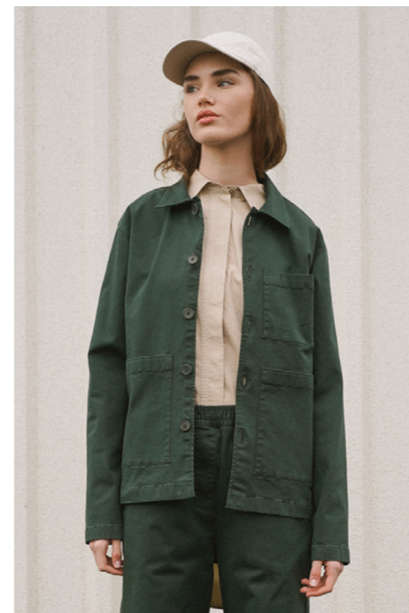
ABOVE CAMERON JACKET - GMTD TWILL - SCARAB PALLA PANTS - GMTD TWILL - SCARAB SHELBY SHIRT - GMTD POPLIN - BEIGE