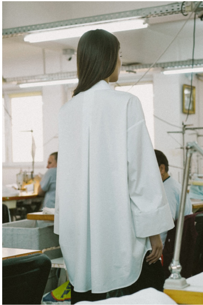
ABOVE & OPPOSITE SIDE SASCHA SHIRT - MAYFAIR SOLID - WHITE