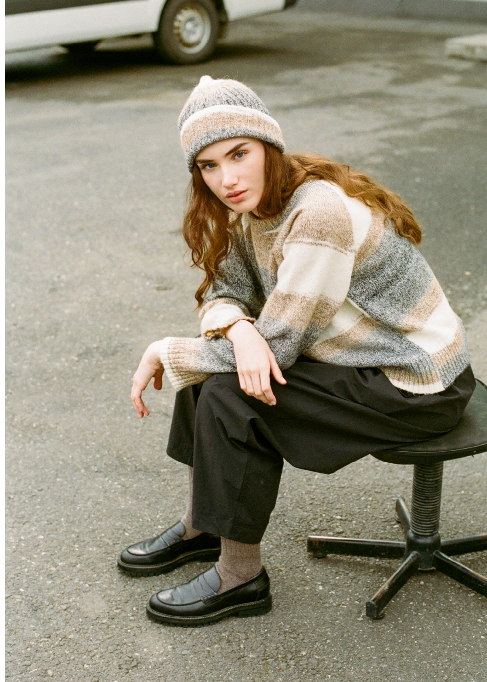
KYRSTEN KNIT - WOOL ALPACA KITTI KNIT - WOOL ALPACA POLARIS PANTS - COTTON TECH - BLACK