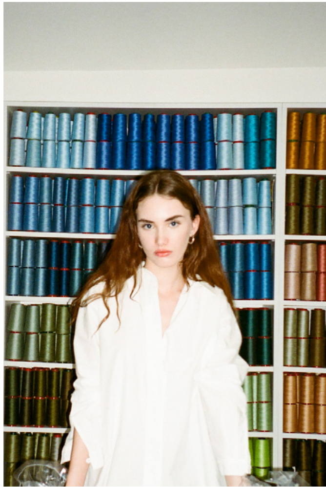
ABOVE & OPPOSITE SIDE SHELBY SHIRT - GMTD POPLIN - WHITE SHELBY SHIRT - GMTD POPLIN - QUIET HARBOUR PISCES SKIRT - COTTON TECH - SAND